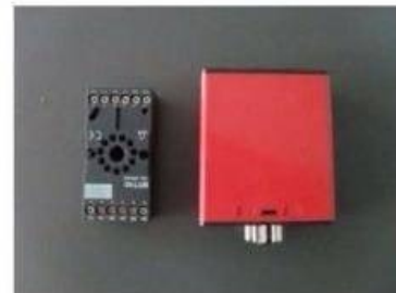
Switzerland Magnetic Loop