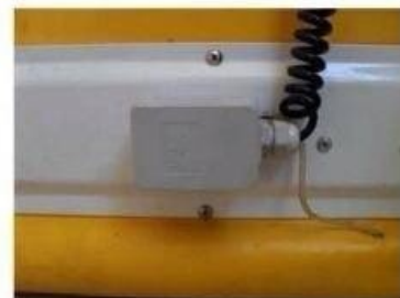
Safe Edge Bottom