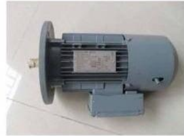
German SEW Motor