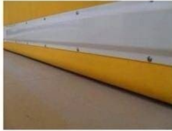
Trap Heavier Fabric