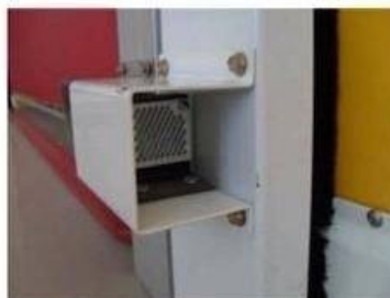
Korea Photoelectric Sensor