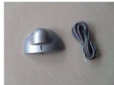
Belgium BEA Radar