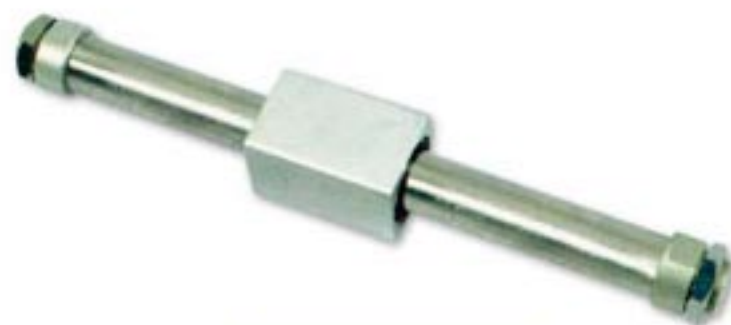
WB Basic type