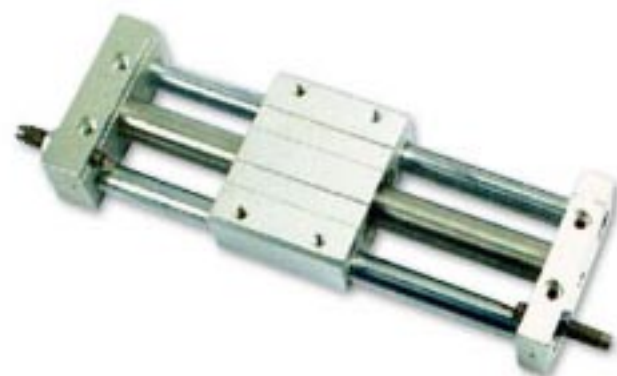
WS Slide type